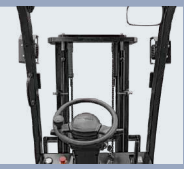
Wide view mas