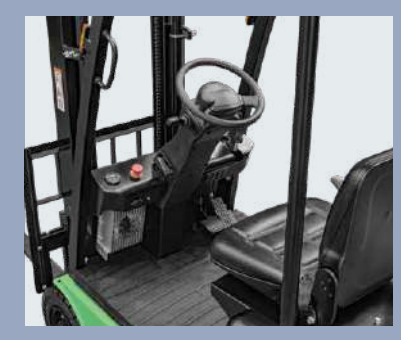
Large and comfortable operation space